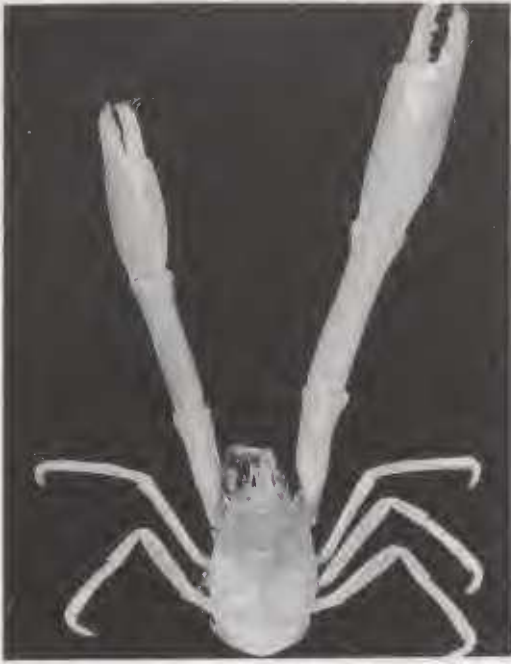
Fig. 1. Uroptychus brucei holotype ♂.

massive but depressed; lateral margins somewhat convex, distinctly ridged; fingers (Fig. 2e) barely half as long as palm, setose especially distally, opposable margins with low processes and tubercles, as figured, distally curving inward and crossing. Left cheliped shorter and slenderer, possibly because of regeneration; about 3 times as long as carapace; opposable margins of fingers bearing fewer processes (Fig. 2f).